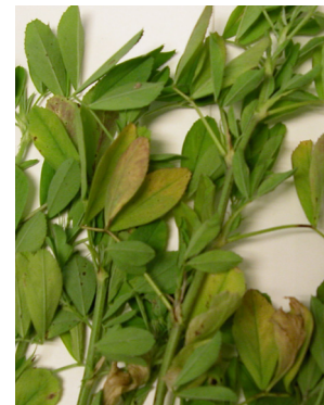
Sulphur deficiency on alfalfa leaves shows up as chlorosis (often inter-veinal) on young leaves.

Plant samples are being collected this summer to assess the extent of potassium (K), sulphur (S) and boron (B) deficiency in Ontario alfalfa fields. Survey results show that 26% of fields tested below the critical level of 0.25% for S as designated by recent Wisconsin studies. Critical level is defined as "the nutrient concentration below which yield loss due to deficiency is expected". Nineteen percent were below critical